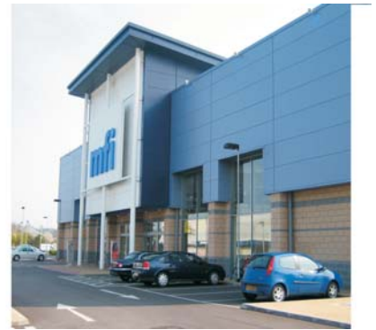
MFI, Valentine Road Retail Park

Work on a new 'Next' edge of town store fit out, at Valentine Road Retail Park, Lincoln started last month following completion of Unit 5 for MFI. The new generation store for MFI in Lincoln is a single storey unit extending 25000 sq ft with dedicated service yard and parking.