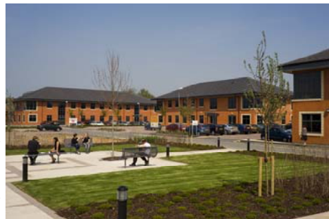
Chetwynd Business Park

In the private sector, working for Wm Davis with Maber Architects, Ward Cole and Arup, the team completed the final phase of Chetwynd Business Park with two detached eco-office buildings which score a BREEAM rating of 'Excellent'. With business becoming sensitive to environmental concerns the Chetwynd Eco-office offers a truly 'green' professional working environment.