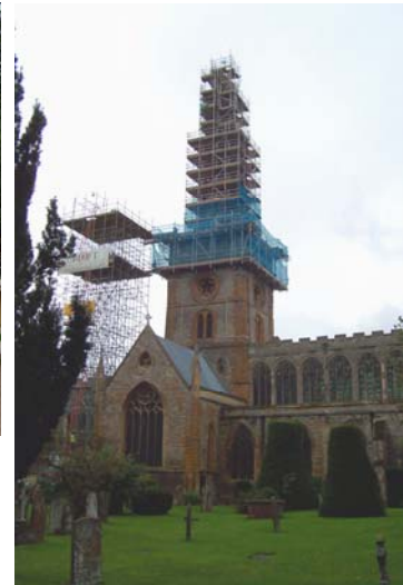
Holy Trinity Church, Stratford Upon Avon